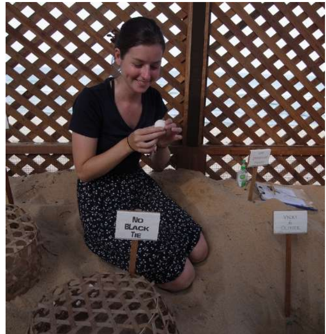
Inspecting a nest for signs of fungal infection.

Every week we pass the daily schedule of our nest checks to the staff at the reception, Teratai Bar and Nelayan Restaurant. This means guests are informed of when they can come over to the hatchery and observe these inspections. This offers guests an interactive and informative experience, as well as a rare opportunity to see turtle eggs and – if lucky – hatchlings.