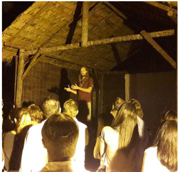
Tanjong Jara guests being given a briefing before a hatchling release.

When guests arrive at our Visitors' Hut there are given a talk on what is about to happen, and a briefing on the 'dos and don'ts', to ensure the release happens smoothly and minimises any risk of unnecessary stress to the hatchlings.