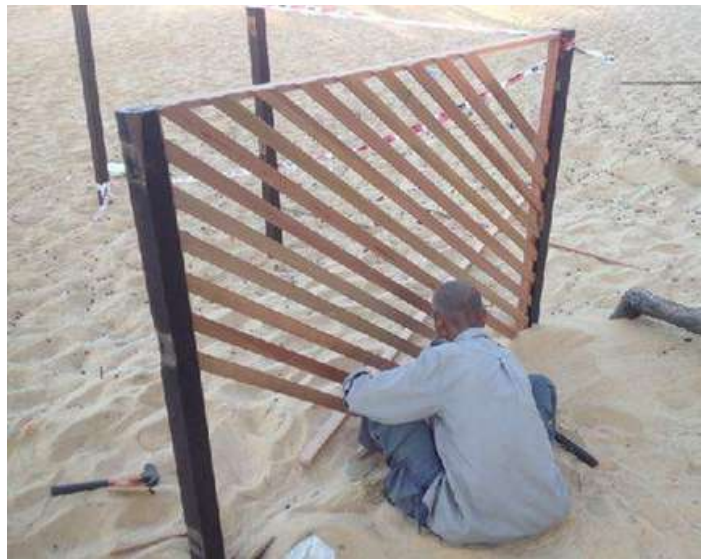
Constructing the hatchery.

The hatchery was constructed using a simple wooden trellis and a traditional roof of attap nipah, in order to blend in sympathetically with the natural, simple, yet elegant aesthetic of the resort.