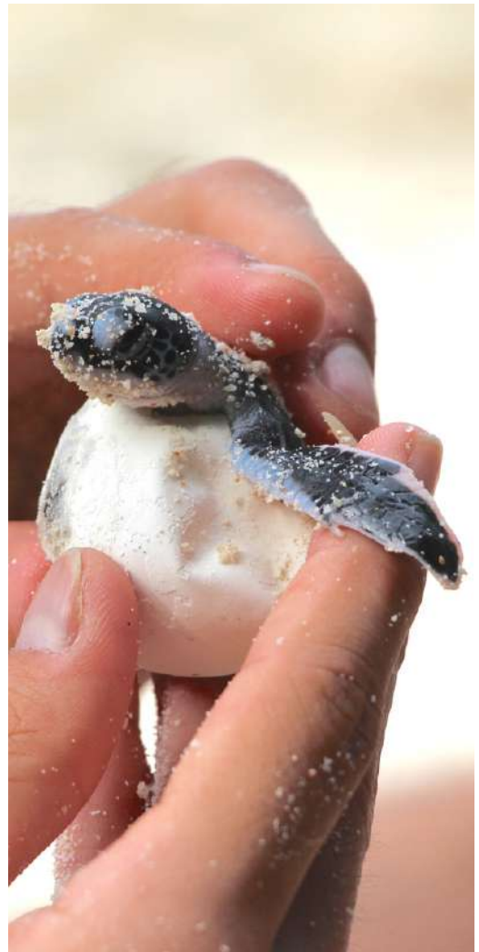
Green turtle hatching from its egg.