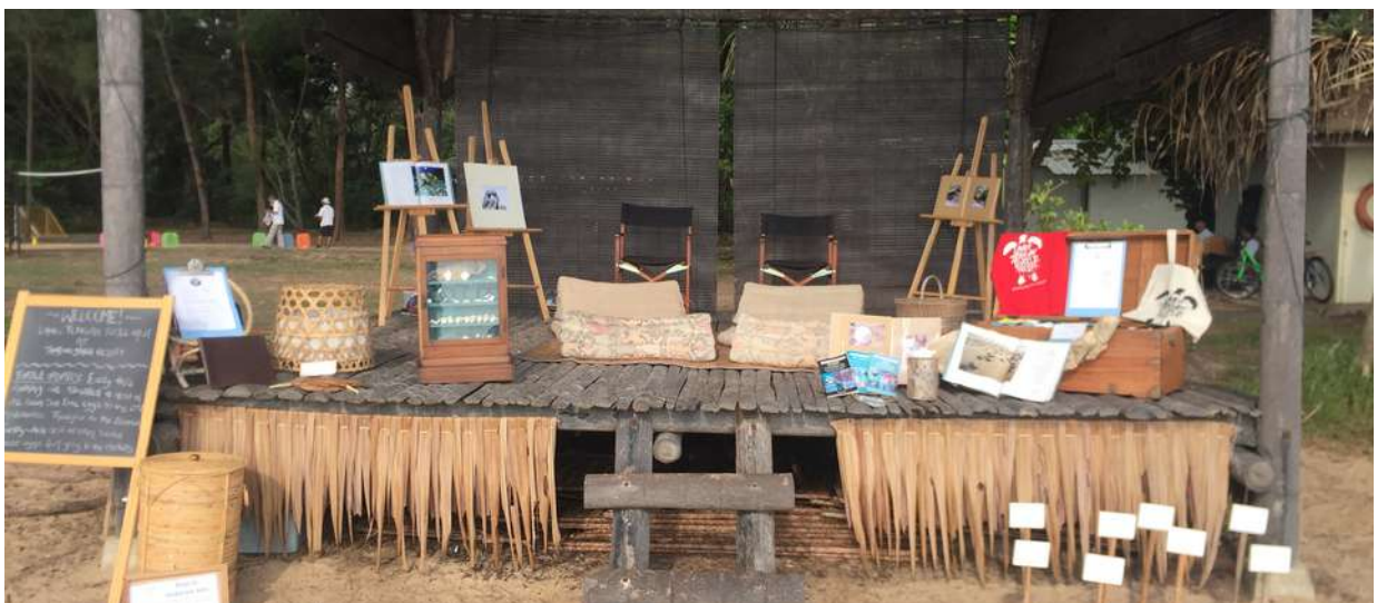
Visitors' Hut completed.

This acts as a base for our staff and interns during the day, as well as providing an informative space for guests to come and find out more about the project, sea turtles and conservation at large by talking with our team and looking through our extensive bank of resource materials.