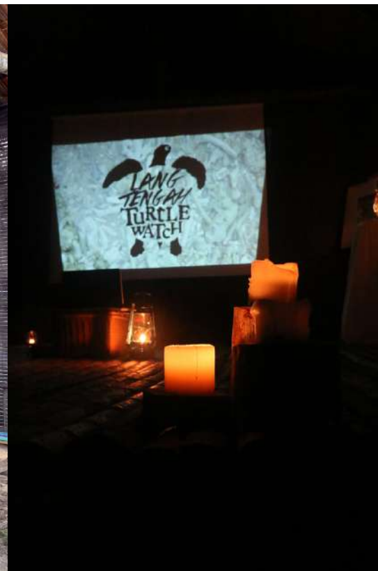
Our Visitors' Hut ready for the official launch of Lang Tengah Turtle Watch at Tanjong Jara Resort.