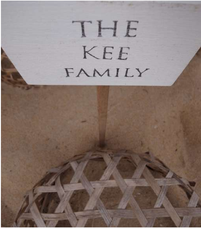
The 'Kee Family' nest