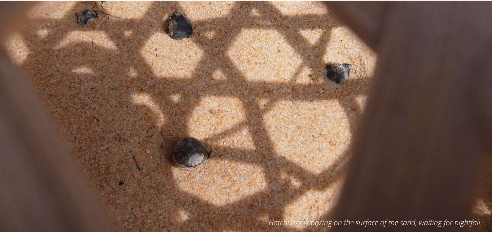
Hatchlings snoozing on the surface of the sand, waiting for nightfall.

Conducting the nest inspections also allows us to ascertain the developmental phase of the hatchlings, and therefore when they will be ready to make their way out to sea. Once we know that hatchlings are ready to be released that evening, we will contact the staff at reception, Teratai Bar and the Nelayan Restaurant, so they can notify guests of the release. This is usually undertaken at 9.30 p.m.