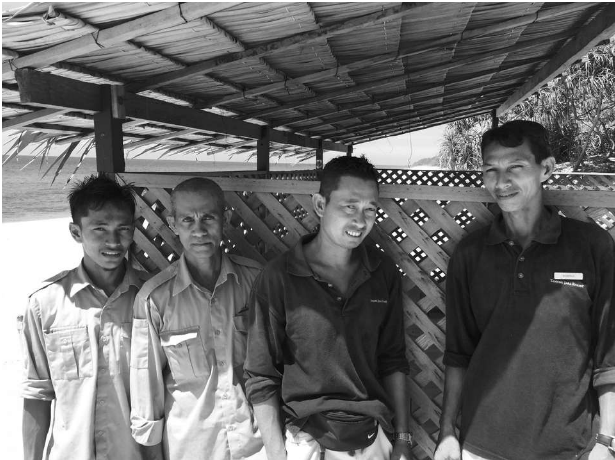
Our dedicated team of rangers.

In order to patrol the beach for nesting turtles, we employed a dedicated team of local rangers, who are also staff at the resort. They also help us with hatching releases.