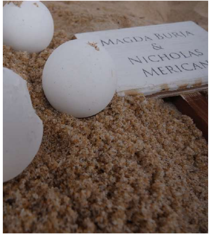
Nest adoption update, with the egg in the foreground thinning and close to hatching.

Once adopted, the nest is then marked with a handmade stake, bearing the name of the adopter's choice. Regular updates are then sent to the adopter, giving details on the development of the nest, any problems that may have occurred and the reasons why. They are also invite to come back and stay at the resort around the estimated time of their hatchlings' release.