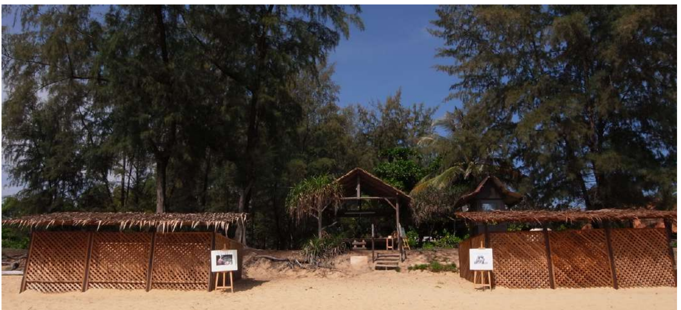
After the construction of our second hatchery.

This programme has been far more successful than we anticipated, and hence we had to use money we received from the guests in the form of donations to build a second hatchery to house all the nests.