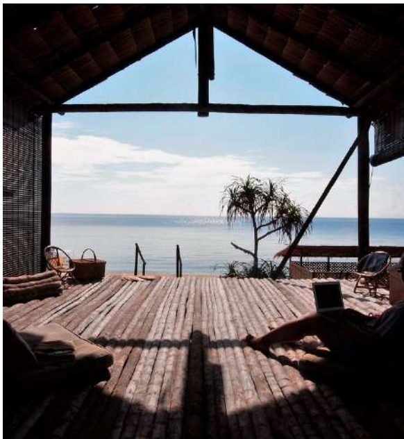
Building the Visitors' Hut, using traditional nibong palm wood.

The hatchery was constructed using a simple wooden trellis and a traditional roof of attap nipah, in order to blend in sympathetically with the natural, simple, yet elegant aesthetic of the resort.