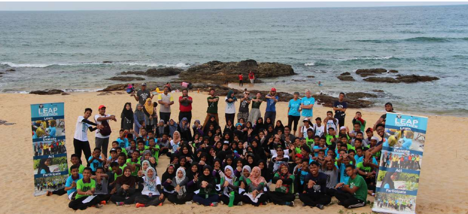
School children, students and our team posing for a photograph after the beach clean-up.

This initial clean-up managed to remove 592 kg of rubbish from the beach, just by the students alone. We feel this helped not only the turtles but the resort too, as we had often heard guests being upset about the amount of rubbish they encountered whilst walking along the beach.