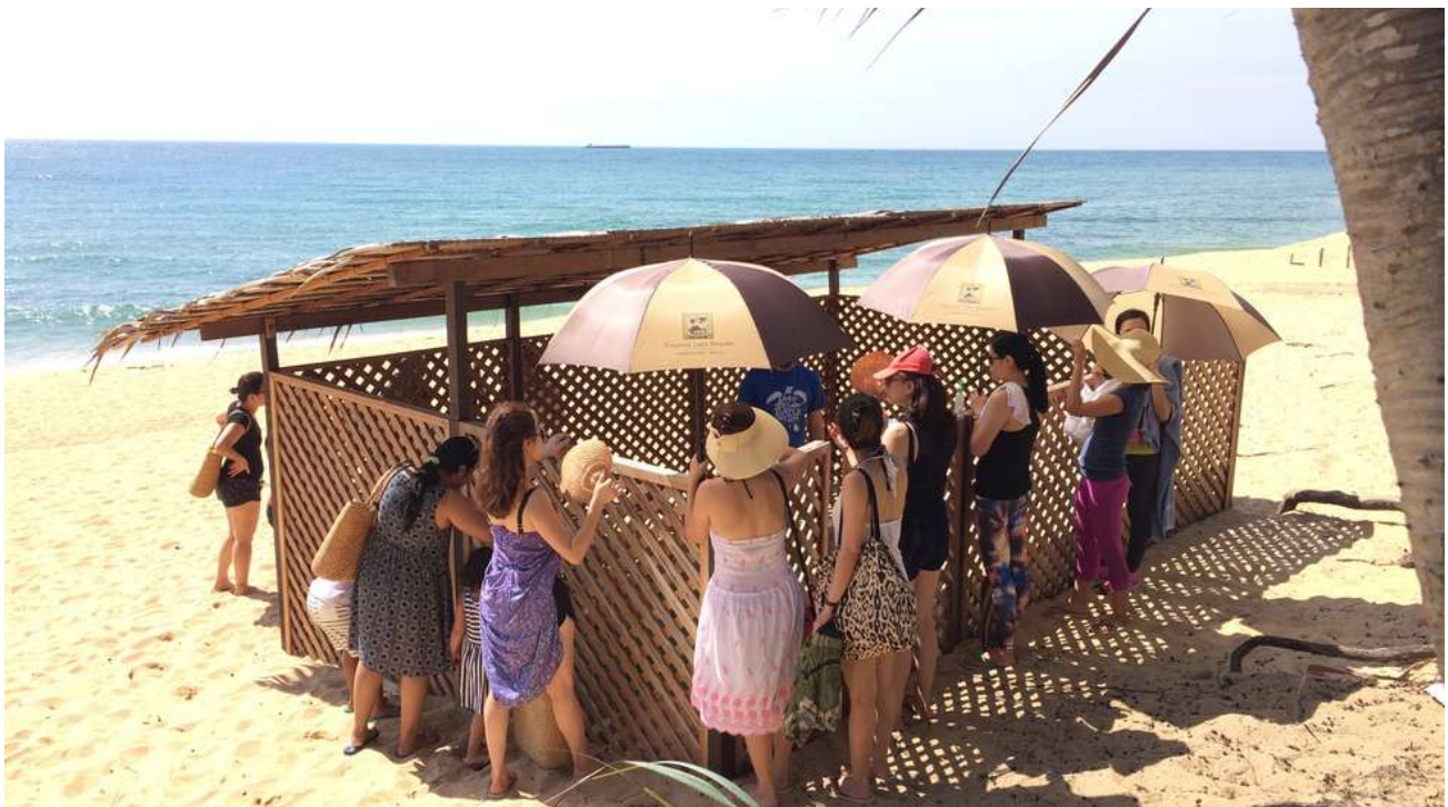
Tanjong Jara Guests gathered at the hatchery for a nest inspection.