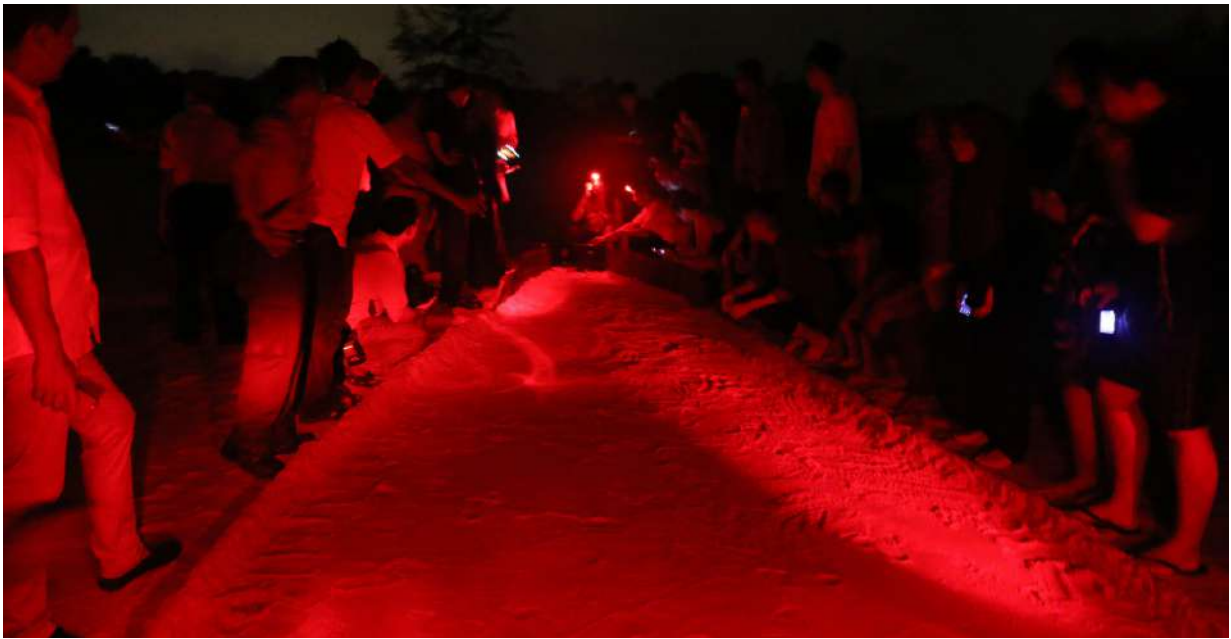
The 'runway' lined with guests ready to release the hatchlings under red light.

The hatchlings and guests are then taken down the beach, away from the bright lights of the hotel – which can disorientate the turtles – to a spot where a 'runway' is made. Hotel guests line the runway, funnelling the hatchlings to the sea and cheering them on.